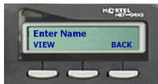
Start spelling name of contact

In addition to making calls via the directory, BCM Dial by Name allows each user to dial numbers displayed on screen in Word documents, web pages, Outlook, etc. By simply highlighting the number required, the user can immediately dial a contact and update the directory via the optional DeskTop client.